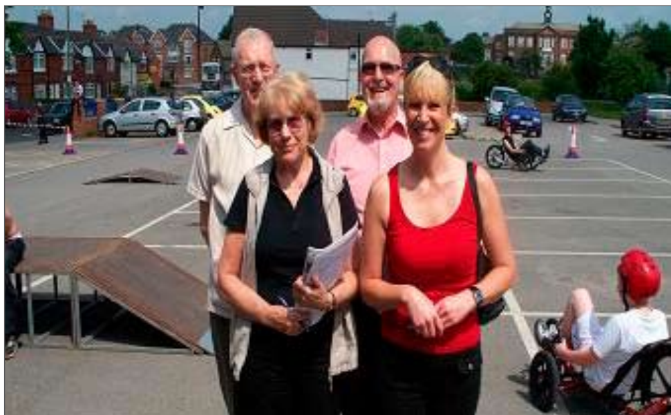
Mobile Skate Park 29/05/09

Anyone from the local area who wants to make a difference and can contribute time, money, advice or expertise to a partnership. Area Assemblies bring together local councillors, council services, businesses, colleges, health, police, churches, community groups and anybody else who can help to make their local area a better place to live and work.