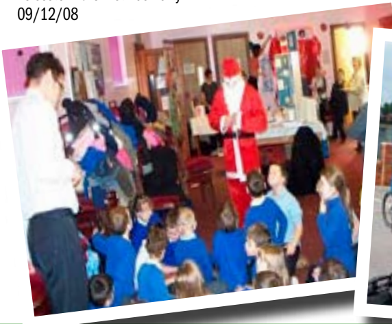
Leicester Rd Christmas Party 09/12/08